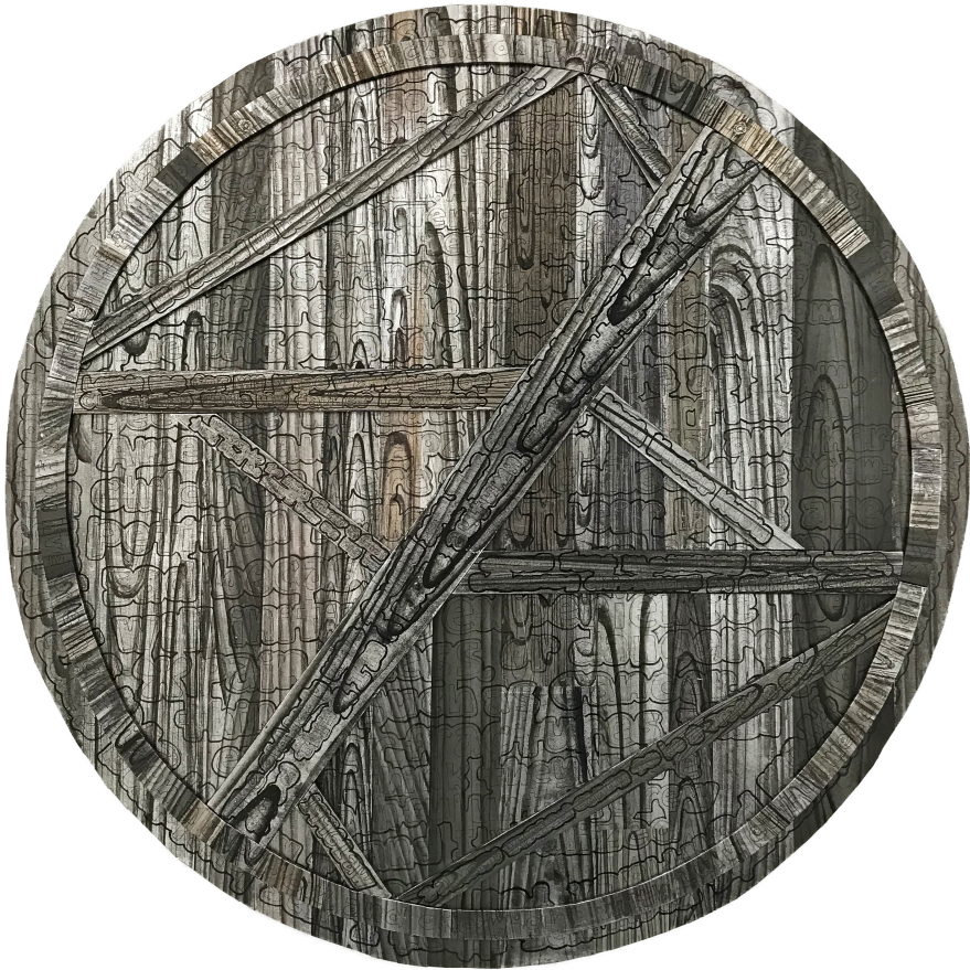
Understory (cars in Belmont on a Friday) , 34in diameter, ink on aluminum leaf on paper, scrambled, donated truth essences, 2020