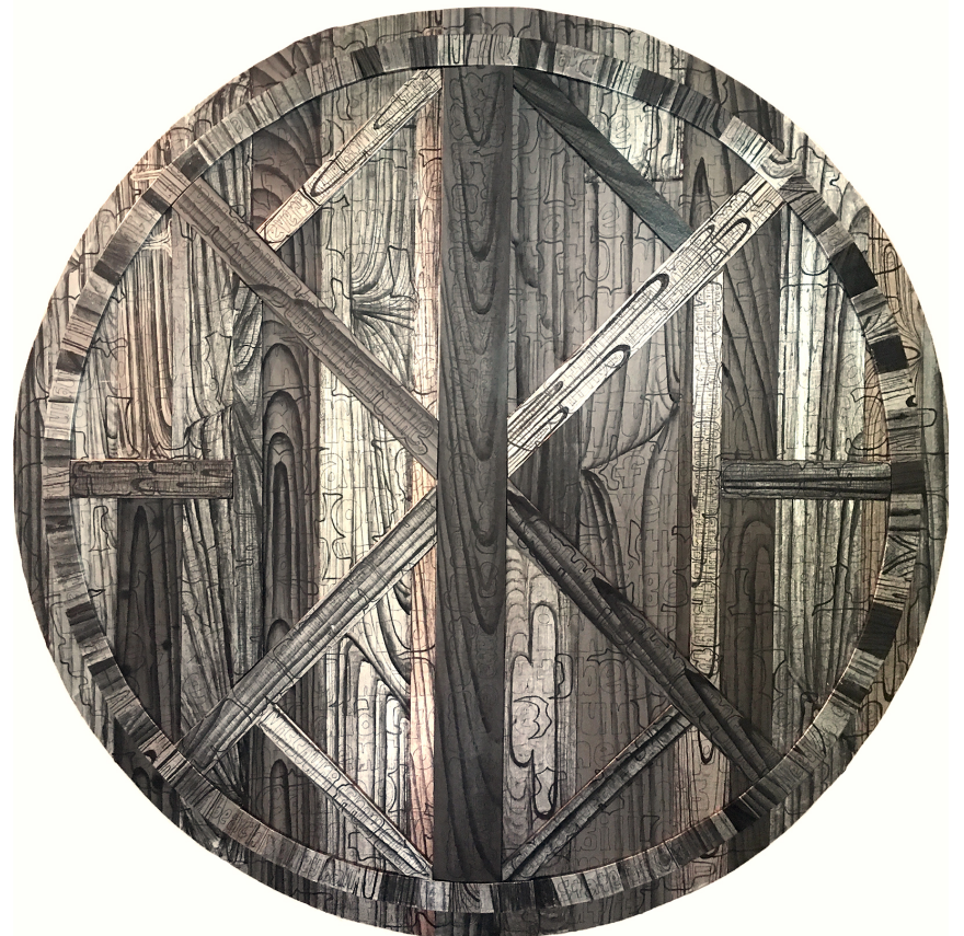
Understory (But it follows the sun) , 34in diameter, ink on aluminum leaf on paper, scrambled, donated truth essences, 2020