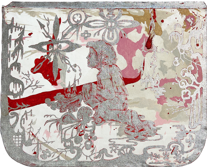
Restored Punch Table Fragment 2 , 21in x 25in, acrylic, aluminum leaf, inks, crowd-sourced spilled jamaica punch on canvas, 2013-2025