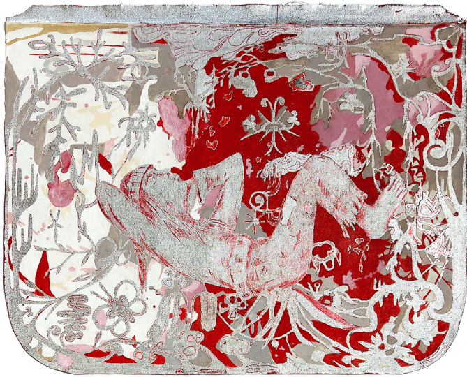
Restored Punch Table Fragment 1 , 21in x 25in, acrylic, aluminum leaf, inks, crowd-sourced spilled jamaica punch on canvas, 2013-2025